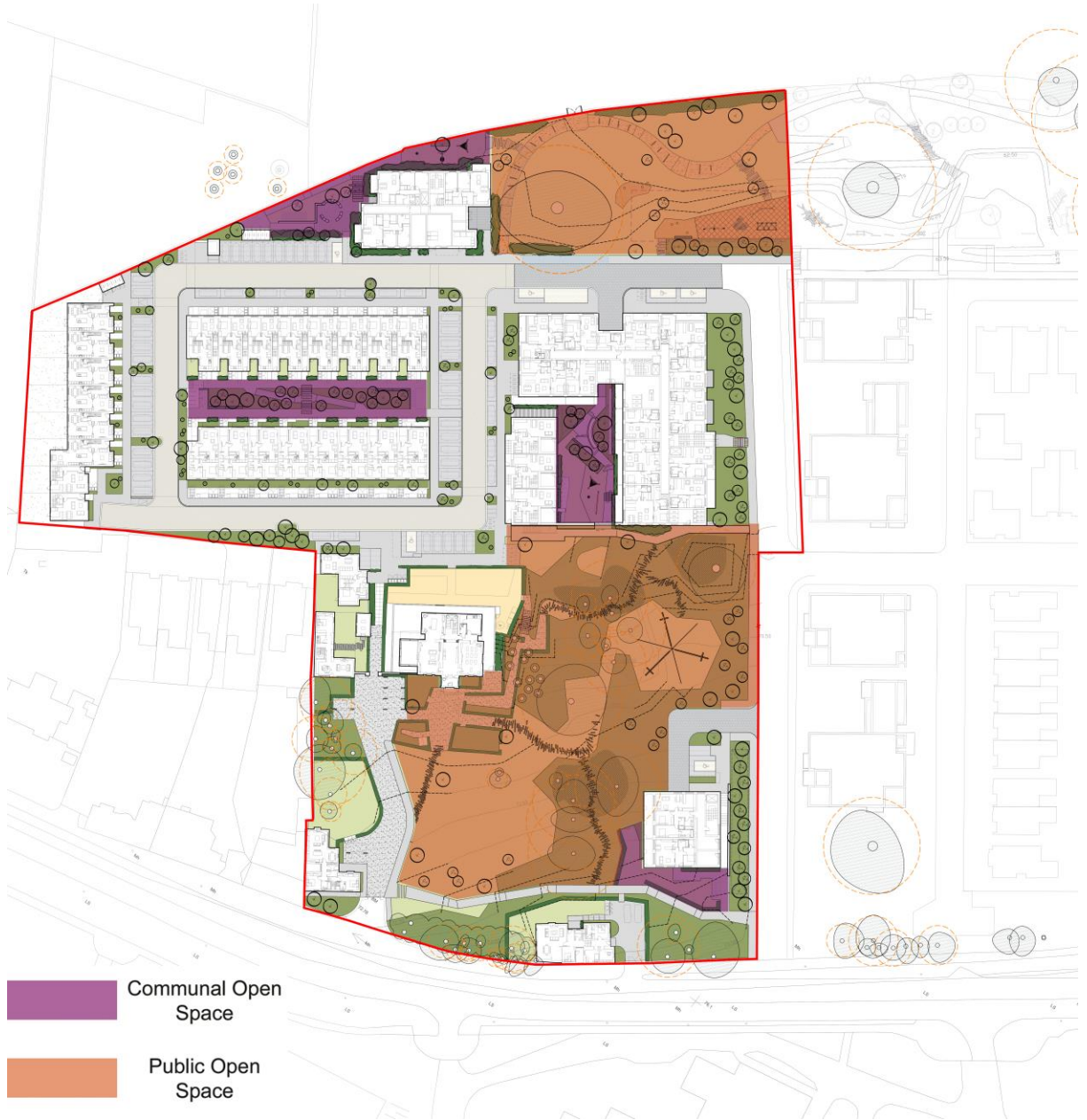
Figure 11: Diagram of open space type and location within site layout.