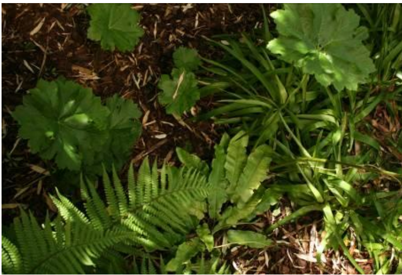
Figure 15: Species for shade groundcover – native & exotic including Dianella , Luzula , Dryopteris and Asplenium .