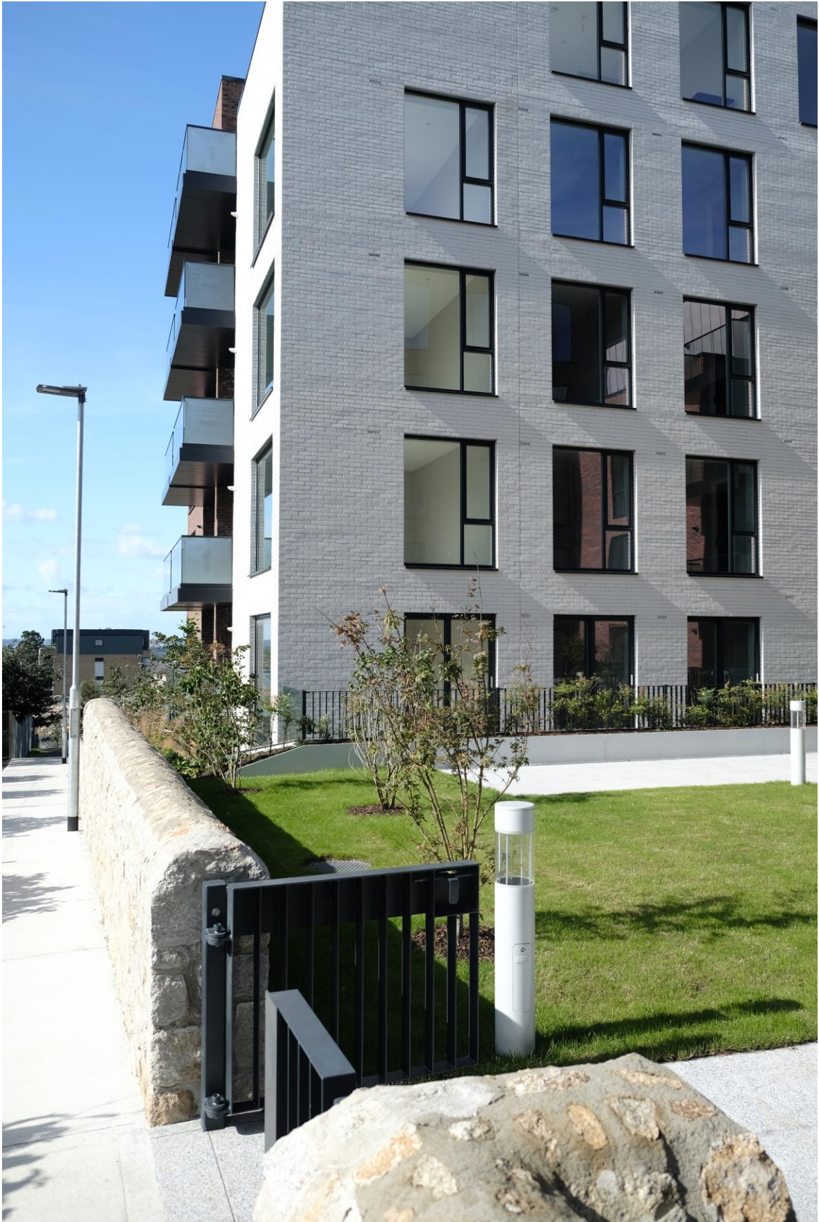
Figure 5: View from the site to the south looking along the edge of completed Phase 1 works.