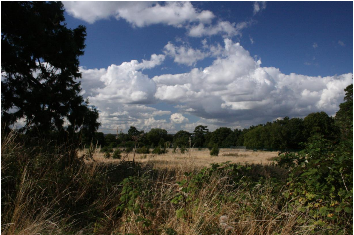
Figure 4: View from the site to the north across the reservation for the 'Eastern Bypass'.

The site is bounded to the north by the unused lands reserved for the future construction of the 'Eastern Bypass' motorway. A 2.4m high round bar railing has been proposed there. The eastern boundary to Phase 2 will marry in with completed Phase 1 works (refer to figure 5).