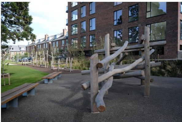
Figure 8: Illustrations of completed Phase 1 playground which will form part of the northern linear park within the project.