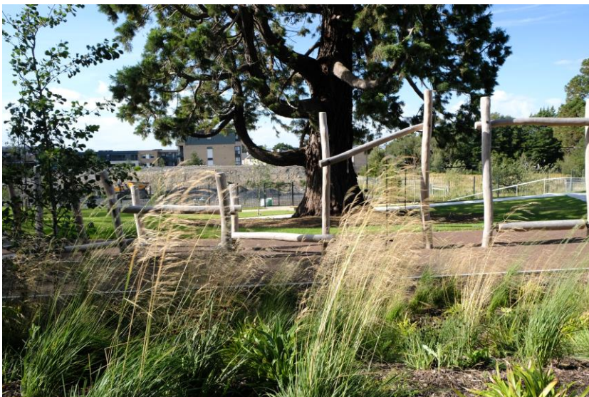
Figure 1, 2 and 3: Works carried out as part of Phase 1 development: View of new streetscape and housing from site entrance (first image), view across public open space with completed new development in background (second image), view across new playground near a mature redwood tree retained as part of new public park.