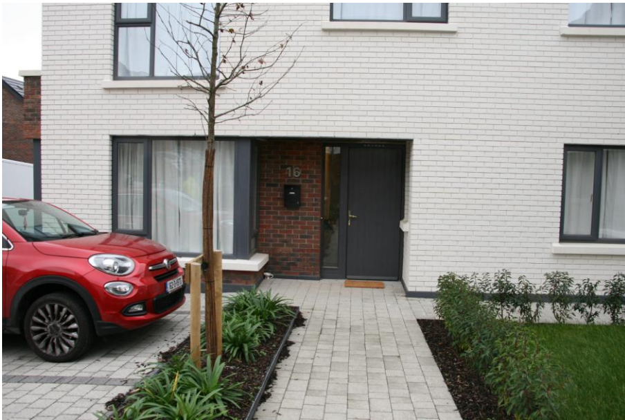
Figure 10: Private front curtilage as part of Phase 1, showing hedging, groundcover and wall boundary treatments.