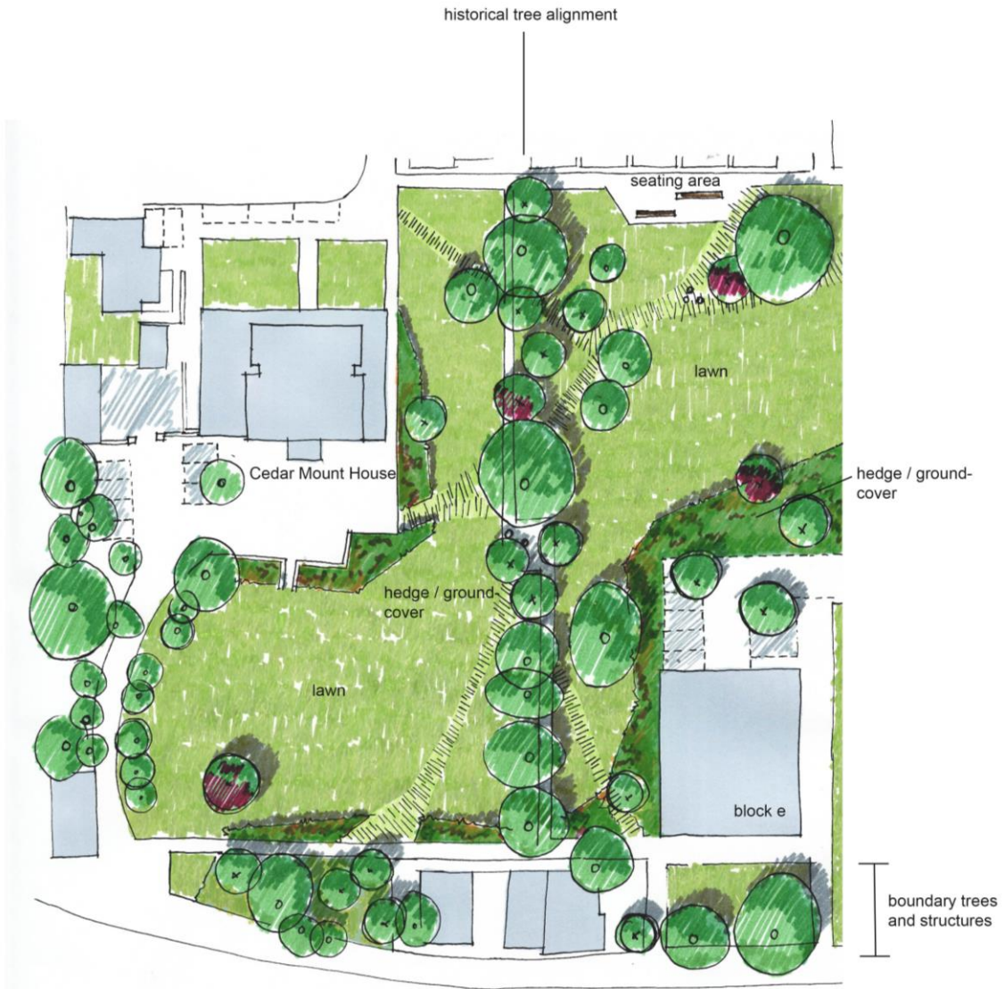
Figure 9: Design development sketch showing the main design considerations of the landscape strategy around Cedar Mount House.

Additionally, a communal courtyard is proposed to the south west of block F and between housing units, north of Cedar Mount House. The spaces created by the footprint of the proposed buildings form a large attractive terrace for the residents to look out on and enjoy. The block F courtyard will tie in with the public open space to south, as seamless 'extension' of the public open space facilitating a range of informal play opportunities and other activities for users. The communal space between the housing units offers a dense planted buffer within the linear strip. Refer to figure 9 for allocation of public, communal and private open space throughout site layout.