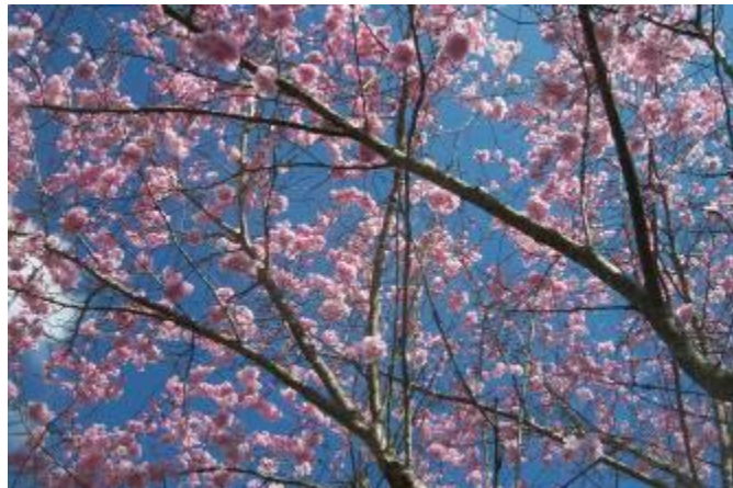
Prunus subhirtella 'Autumnalis' (Cherry) (winter)