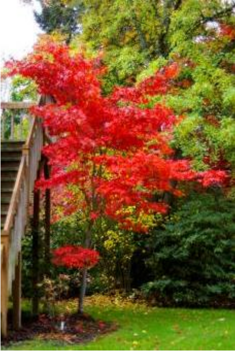
Acer palmatum 'Osakazuki' (Japanese maple) (autumn colour)