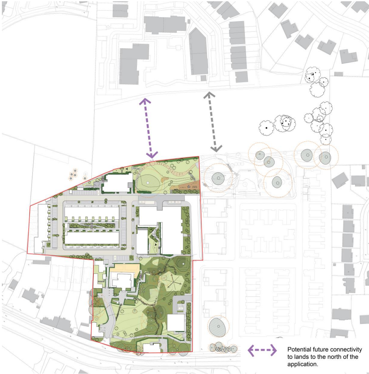
Figure 7: Diagram illustrating potential future connection from the proposed application