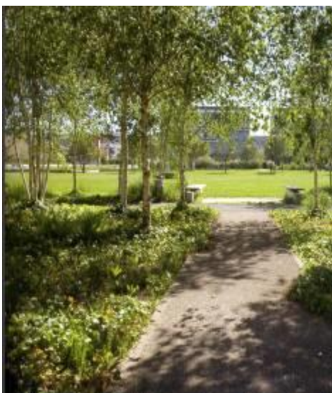
Figure 16: Typical groundcover under tree canopy