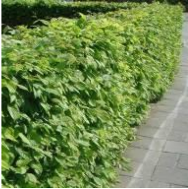
Carpinus betulus (hornbeam)