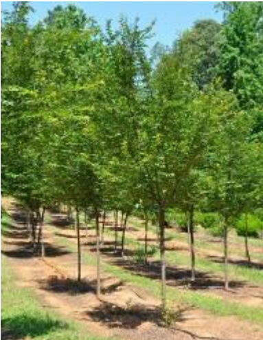
Prunus subhirtella 'Autumnalis' (Cherry) (summer, in the nursery)