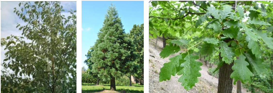
Figure 12: Illustrating a selection of proposed native tree species. Left: Alnus glutinosa (alder) (canopy); Centre: Sequoiadendron giganteum (giant redwood) (semi-mature); Right: Quercus petraea (sessile oak).

Tree species are selected for longevity, suitability to local soil conditions and microclimate, biodiversity (native species) and where required suitability to close proximity to residential buildings. Proposed tree sizes range from semi-mature (35-40cm girth), to extra heavy standards and multi-stemmed trees. A total of 188 new individual trees are proposed in order to compensate for the removal of existing trees and to improve the species mix and the proportion of native species. Typical species are illustrated on the following pages.