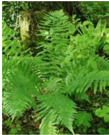
Dryopteris filix- mas