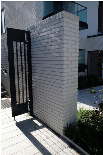
Figure 18: A range of paving details: concrete steps in grass (left), natural stone paving detail with bespoke courtyard gates (right).