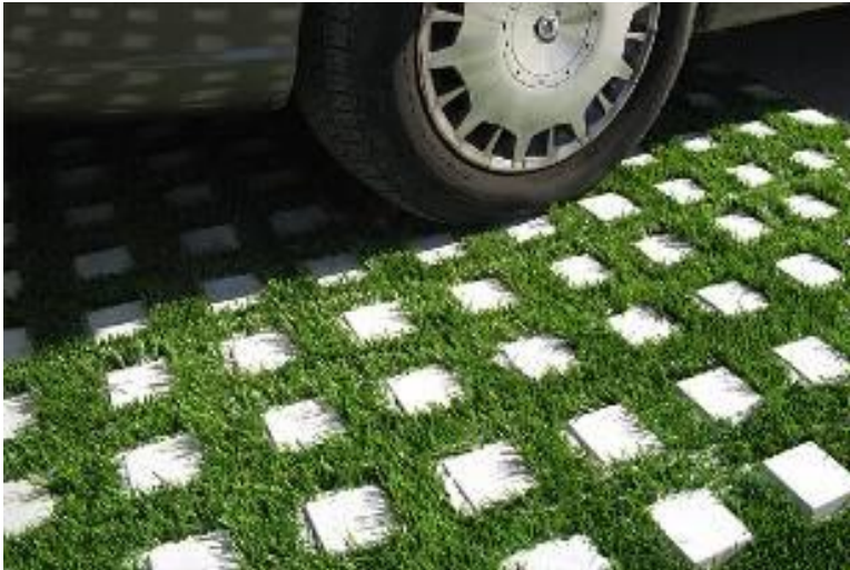
Figure 19: Integrating paving and soft landscape: (left) natural stone in lawn, (right) reinforced grass using 'Checker Block' concrete modular product.